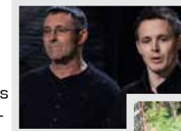
The Barrow Booster